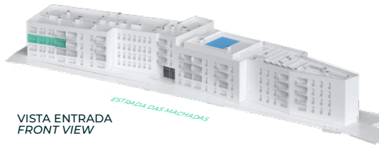
VISTA ENTRADA FRONT VIEW